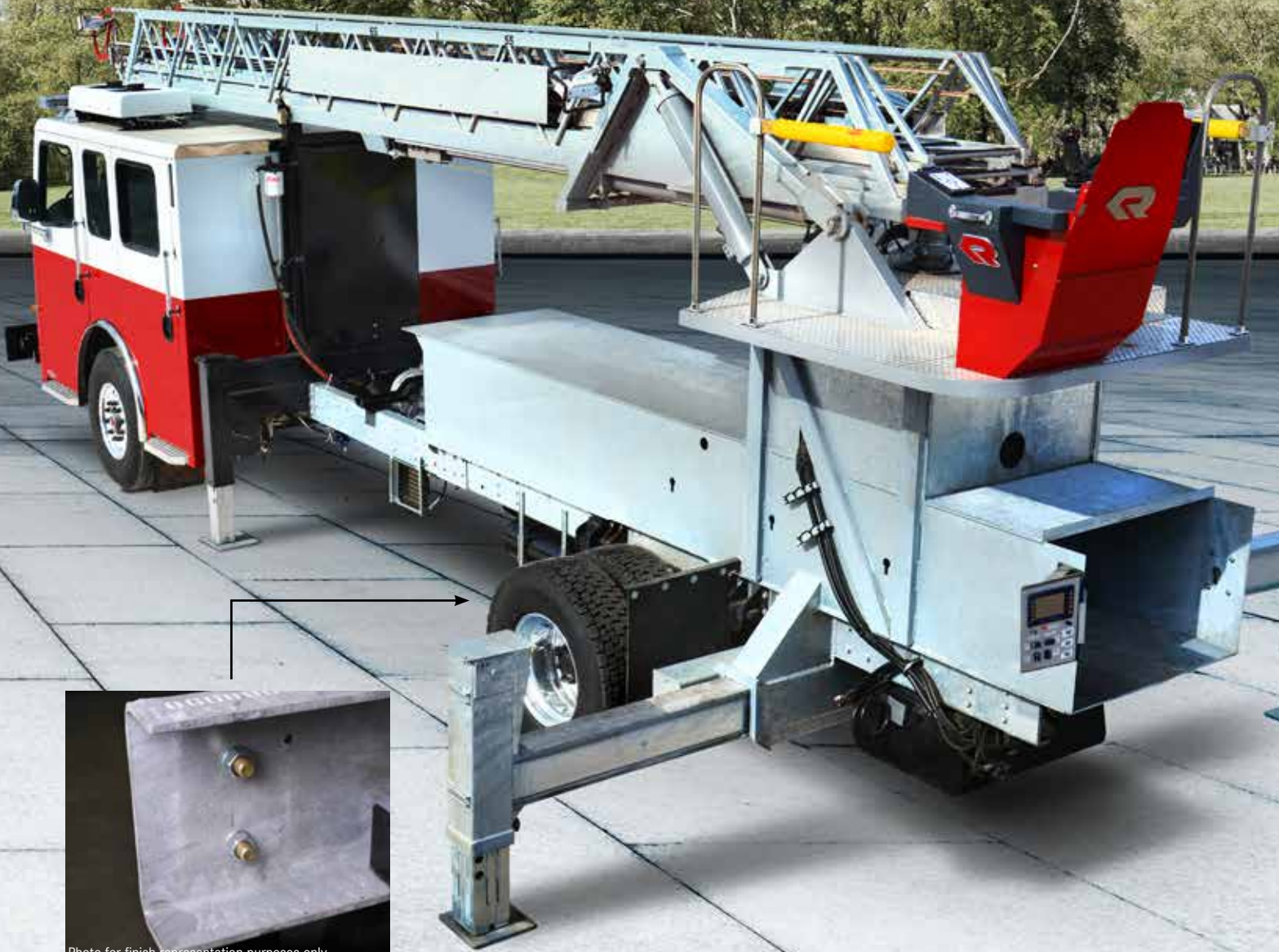
Photo for finish representation purposes only