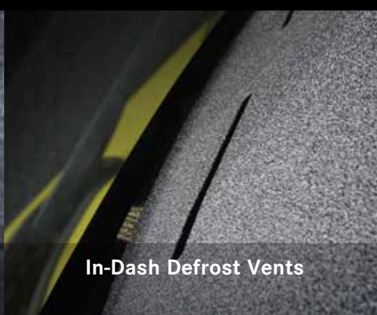
In-Dash Defrost Vents