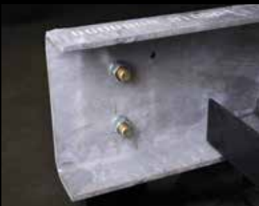
Hot Dip Galvanized Rail and Cross-Members Optional