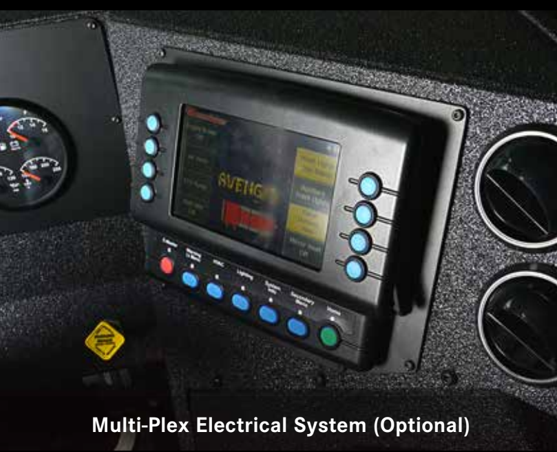
Multi-Plex Electrical System (Optional)