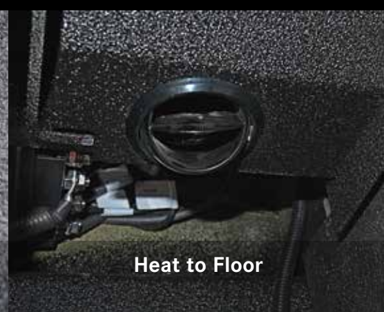
Heat to Floor