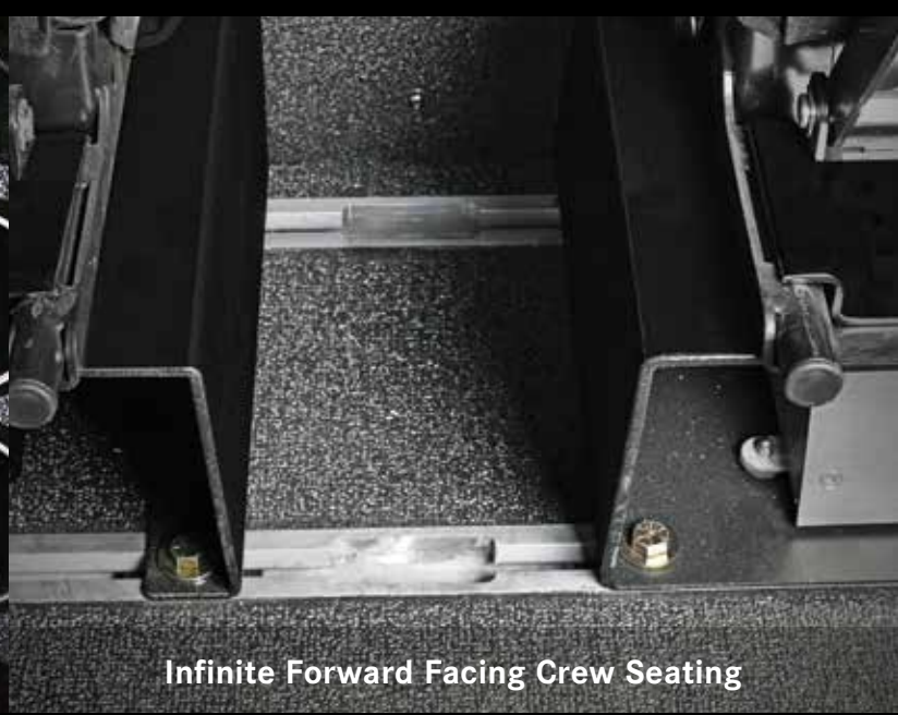
Infinite Forward Facing Crew Seating