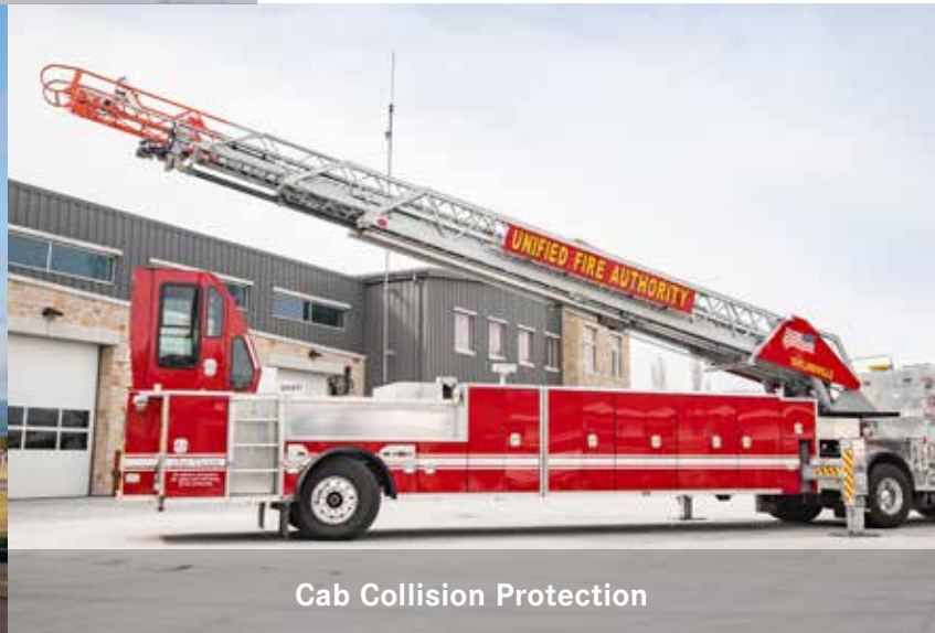
Cab Collision Protection