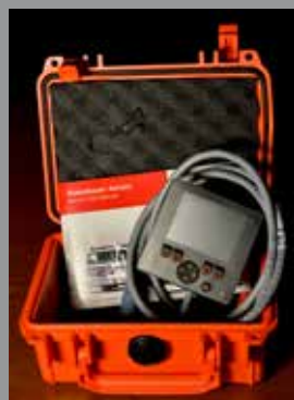
Case not included

Keeping trucks in service is our number one goal, that is why we do our best to use products that are available on the market and are not proprietary to Rosenbauer. An aerial service tool is also available for quick and easy diagnostics of the CAN-bus system.