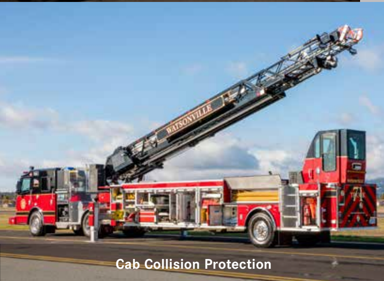
Cab Collision Protection

Whether you prefer a more traditional or contemporary truck, Rosenbauer offers the ability to build your aerial with or without a pre-piped waterway.