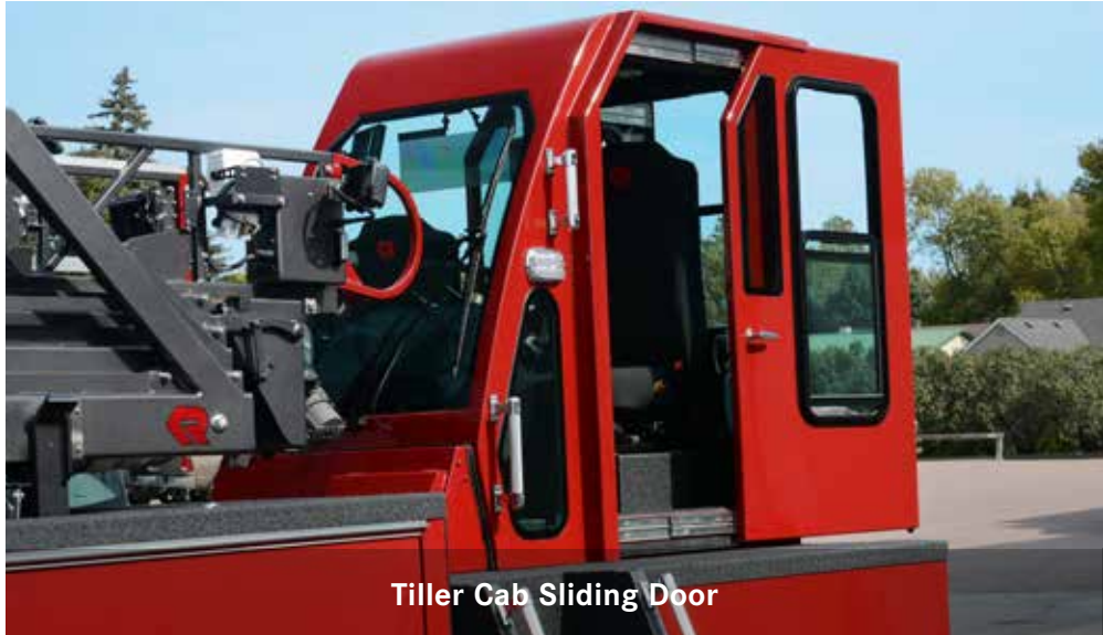
Tiller Cab Sliding Door

Safety is paramount. That's why Rosenbauer offers safety equipment, including a tillerman trainer's seat on every truck, providing extra security during training by allowing an experienced tillerman to sit right next to the trainee.