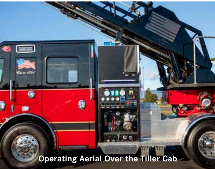
Operating Aerial Over the Tiller Cab